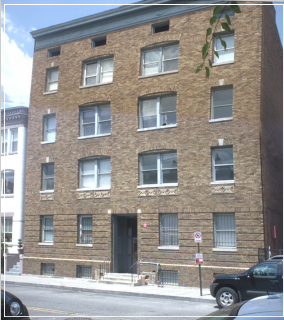
FRONT VIEW FROM PARK ROAD

1319 PARK RD., WASHINGTON DC 20010 24 UNITS, FOUR LEVELS WITH BASEMENT